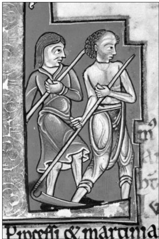
This detail from a twelfth-century illuminated manuscript shows peasants using scythes to cut hay.

Serfs produced their own food, which was just as plain as the quarters in which they lived. They ate a diet of black bread and vegetables such as cabbage, carrots, and onions. They also had dairy products and some pork. Water was usually unsafe to drink, so they drank mostly ale. They had no sugar, no potatoes, no tea, and no coffee. They did have salt, but only in limited amounts. They seldom ate meat.